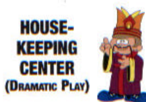
HOUSE-KEEPING CENTER (DRAMATIC PLAY)